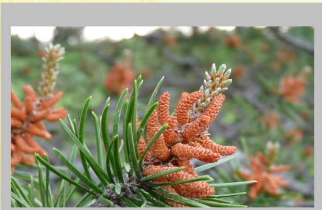
Red pine (male) catkins

Catkins are considered by many as a survival food. Many trees produce catkins and they are a source of protein. Birch catkins also contain beta carotene and trace minerals.