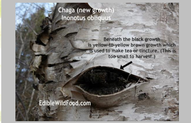
New chaga growth

Chaga has been named the “Gift from God” by the Siberians as well as the “Mushroom of Immortality.” The Japanese call it “The Diamond of the Forest,” while the Chinese deem it “King of Plants.” One of the reasons for this is because chaga contains the enzyme, superoxide dismutase. This enzyme is powerful because its function is to halt oxidation.