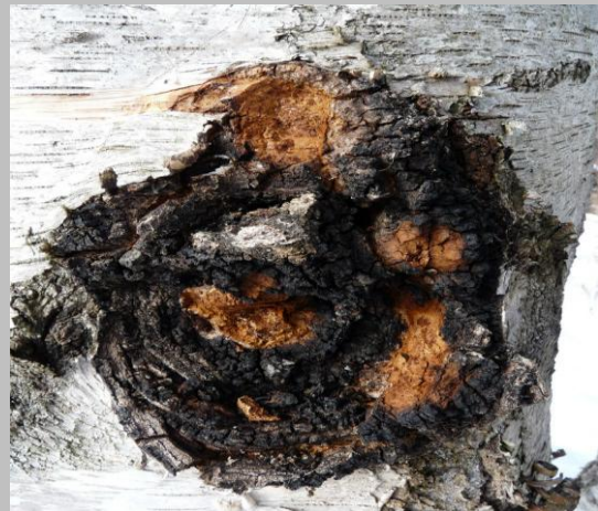
CHAGA (Inonotus obliquus)

In addition to containing a wealth of vitamins and minerals, chaga contains flavonoids, phenols, minerals, and enzymes. It is a dense source of pantothenic acid, and this vitamin is essential for us to have healthy adrenal glands. (Continued.....)